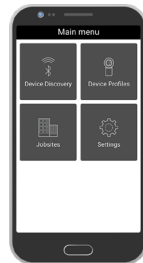
Phone app interface for Z311B sensor