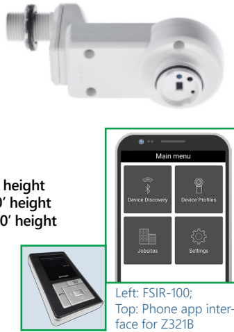
Left: FSIR-100; Top: Phone app interface for Z321B