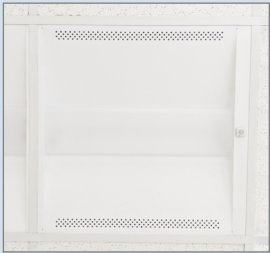
Left: FFR with AR (Plenum Ceiling Air Return) option

(1) 120-277V / 0°C-55°C ambient. To estimate lumen output in emergency mode, multiply EM wattage by the Lumens per Watt of the lowest output setting of the luminaire it is installed in. ex. FFR G2 22 SEL45 UV FA 940 EM10 → 137.6 LPW x 10W = 1,376 lm