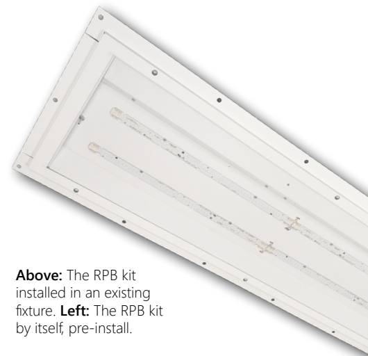
Above: The RPB kit installed in an existing fixture. Left: The RPB kit by itself, pre-install.