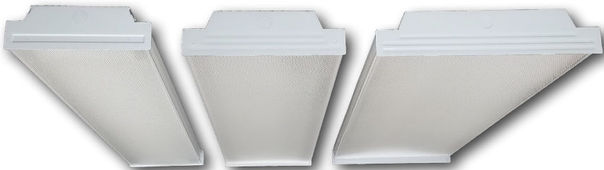
The EWL G2 is available in three width options: 9", 11", and 16"

The EWL G2 features field replaceable boards and drivers. This allows you to upgrade to more efficient technology in the future. Or, in the rare event of a failure, you can rapidly replace defective components. Re-boardABILITY helps to ensure you won't get stuck with an obsolete light fixture. Learn more about Re-boardABILITY here.