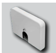
Mouse Hole End Cap (MH)

(1) Not available on all models. Certain conditions apply. Consult factory or sales representative for details.