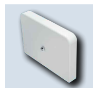
Tapped Hole End Cap (TH)

CC Conformal Coating LVL 0-10V Dimming Leads for Easy Field Access BAA Buy American Act Compliant