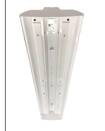
STEP 2 REMOVE LAMPS (RECYCLE LAMPS)

INSTALL GROUND LEAD TO LUMINAIRE USING TEK SCREW AND WASHER