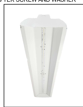
STEP 6 SWING FFRP18WRAPT8S AND SECURE TO THE FIXTURE FITING THE FFRP18WRAP AROUND THE LUMINAIRE

UP LIGHT COVERS (4) 2 FOR EACH SIDE WITH (2) TEK SCREWS PER COVER