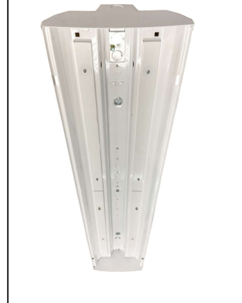
STEP 4 REMOVE BALLAST SOCKET BARS AND ANY WIRING FROM THE LUMINAIRE FOR UP LIGHT LUMINAIRE INSTALL

UP LIGHT COVERS (4) 2 FOR EACH SIDE WITH (2) TEK SCREWS PER COVER